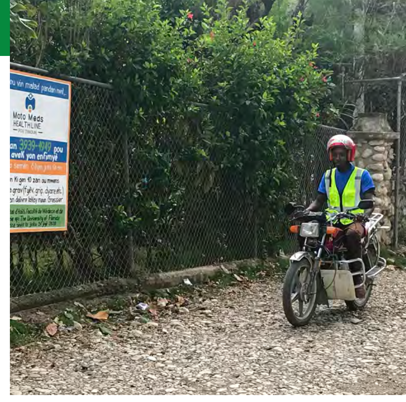
A MotoMeds driver outside of the call center in Gressier, Haiti. Drivers are a critical resource: "They can navigate without maps or GPS to get to patients."

The drivers are another critical resource according to Molly Klarman, Project Director for MotoMeds Haiti. "Their granular sense of the existing road networks allows them to navigate without maps or GPS, or a formal address system, using landmarks to get to patients." Furthermore, the drivers often assist in treating mild cases by sharing video