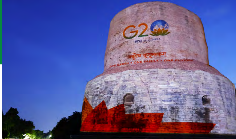
In 2023, India led the G20 summit, making One Health a key theme of the conference.