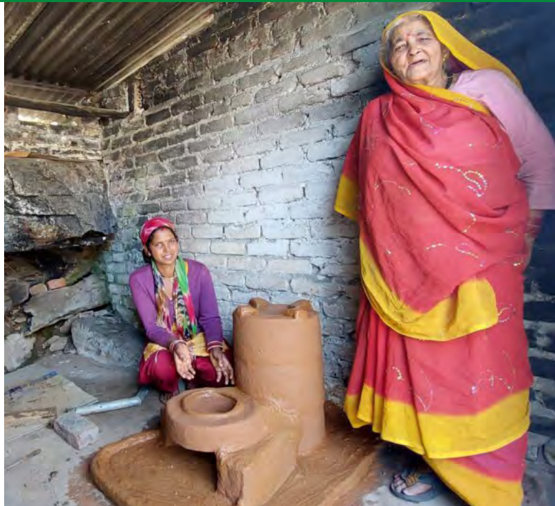
One type of clean cookstove is a smokeless mud model developed by the Smokeless Cookstove Foundation.

Based on this study, he published a paper highlighting