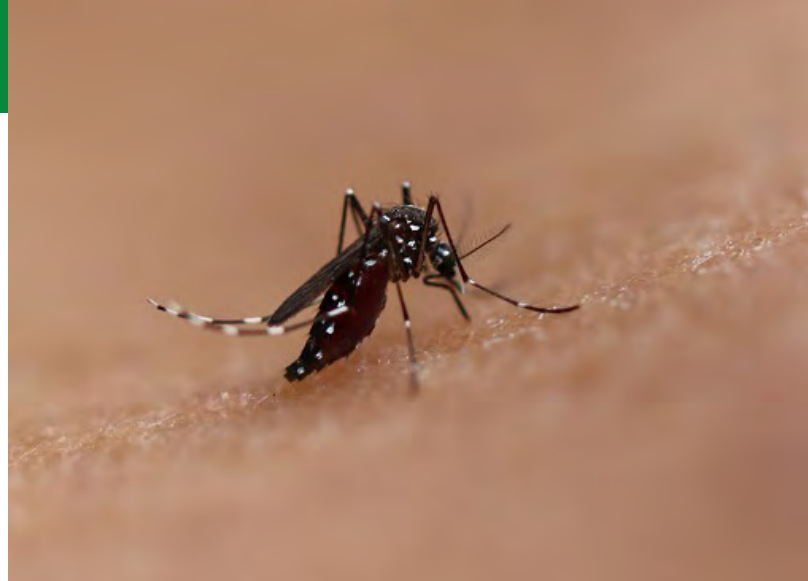
Aedes mosquitoes, like the one shown here, can be vectors for the virus which causes chikungunya.

Valneva, which develops, manufactures, and commercializes vaccines addressing unmet medical