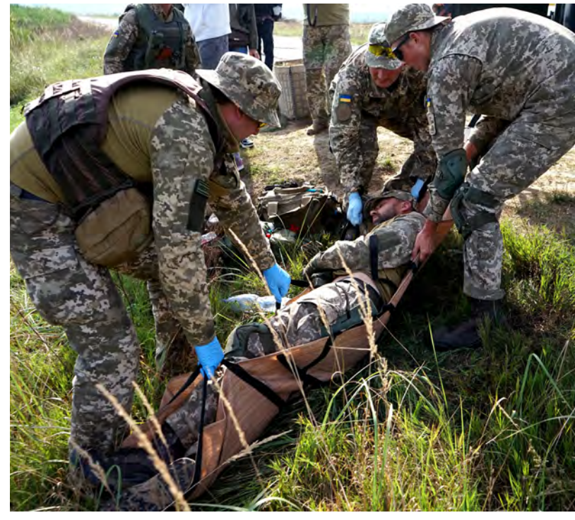
Ukrainian soldiers provide medical response in a simulated casualty situation in 2018

It's well known that the immune system is a contributor to inflammatory and neuropathic pain, which can be caused by various diseases or injuries. Growing evidence now indicates the complement system is "almost inevitably involved in most pain conditions," says Usachev. Using mouse models, Usachev's team has verified that the complement system is a critical modulator and regulator of neuropathic pain. They also discovered that the site of action for the complement system in neuropathic pain is the spinal cord. "The therapeutic implication is that any new drug will need to have good blood brain barrier permeability," says Usachev. "Another important finding is that, among the multiple cell types in the spinal cord, microglia is the key one." The project has also shown neurons to be involved, most likely indirectly. Going forward, Usachev's team will focus on understanding how connectivity from complement system to microglia to neurons works.