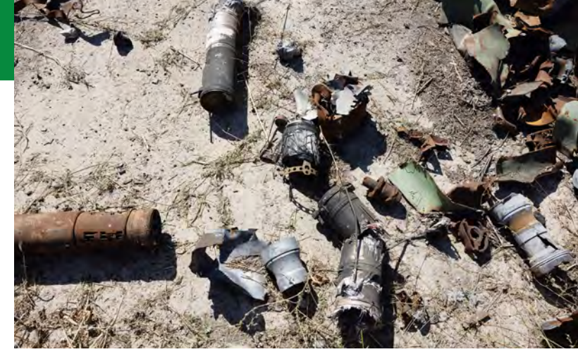
Unexploded ordnance in farmland in Yahidne, Ukraine.

DeHovitz explains that the collapse of the Soviet Union