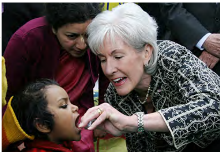
HHS Secretary Kathleen Sebelius said the agency's new strategic plan for global health emphasizes both threats and opportunities, including childhood vaccination programs.

Global health diplomacy is the plan's third area of concentration, to advance U.S. interests through partnerships with the State Department, USAID, and others. The strategy is designed to support the President's Global Health Initiative, an interagency effort, and takes into account the GHI focus on investing in the health of women and girls. "This is something I've seen firsthand in both the U.S. and in my travels around the globe," Sebelius observed. "When you give women better access to health information and services, there are huge benefits not just for the women themselves, but also for their children, families, and communities."