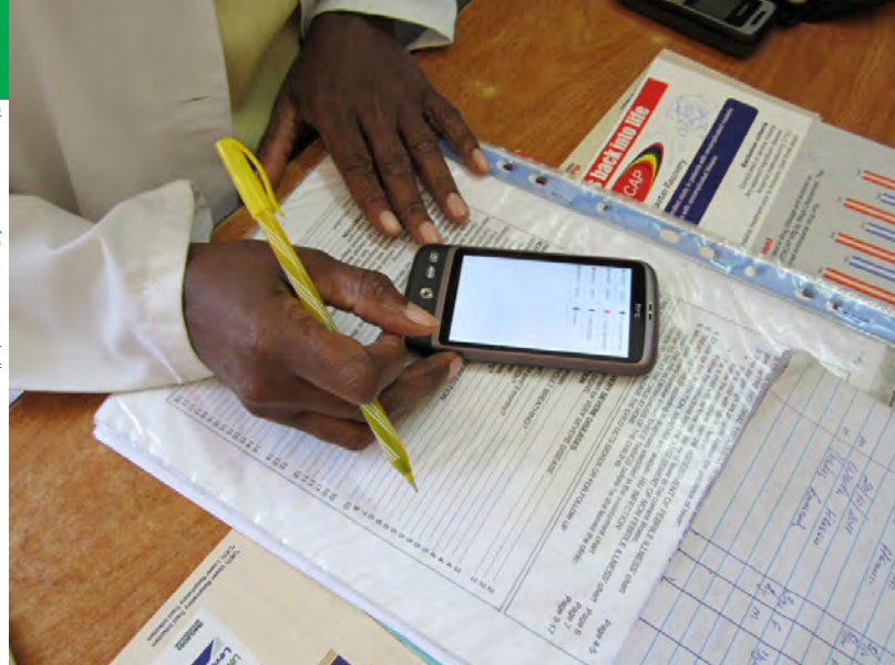
A study in Tanzania has shown when health care workers use electronic versus printed protocols they are more likely to appropriately diagnose, treat and refer their patients.

changes to the new system, however, and less time-consuming to train health workers to use it. "On average, it took approximately an hour to train health workers who were already familiar with the protocols to use them on the phone," Mitchell said.