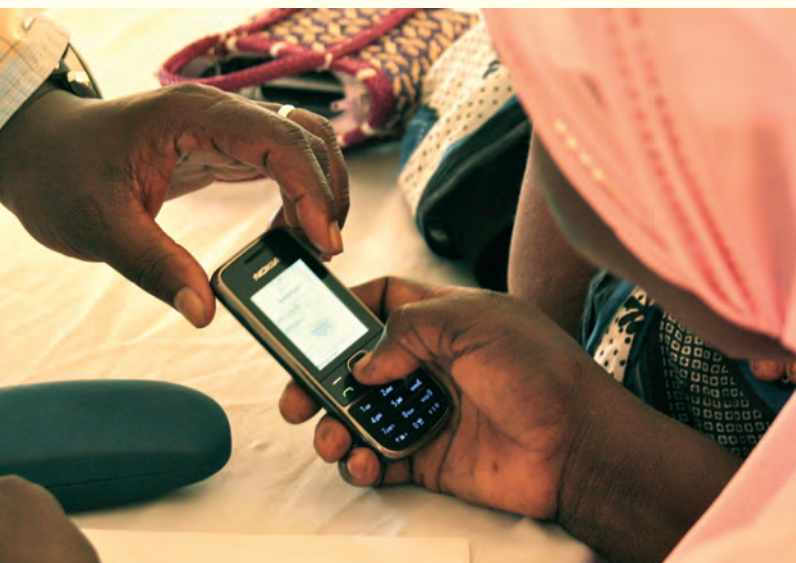
While many women in developing countries are responsible for their family's health, they do not always have access to cellphones.