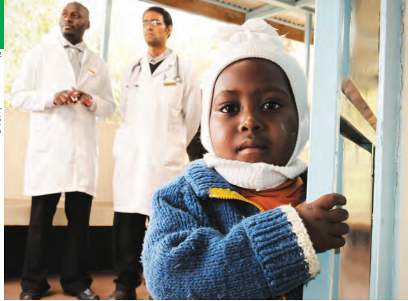
USAID’s new strategic framework for success in global health emphasizes greater interagency collaboration, country ownership and smart service integration.

coordination, country ownership and smart service integration while aligning previous health initiatives for greater efficiency, namely the President’s Malaria Initiative and the President’s Emergency Plan for AIDS Relief,” he added.