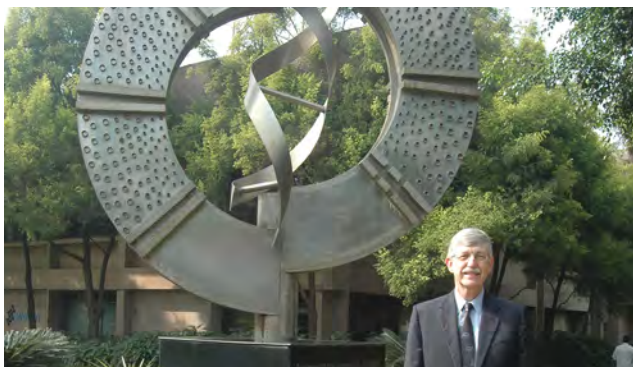
NIH Director Dr. Francis S. Collins recently spent a week touring India's top research sites including Biocon in Bangalore, where he posed with a statue dedicated to leaders in genomics.

NIH Director Dr. Francis S. Collins made his first official visit to India recently, touring the country's top research sites, reviewing existing collaborations and discussing potential new areas for partnership. India is scaling up its investment in research and training, providing additional opportunities for collaboration. Collins met with leading scientists and students at NIH-funded institutions, gave several public lectures and participated in a summit on low-cost medical technologies. A joint U.S.-India effort is being explored to spur development of affordable diagnostics and interventions intended to drive down health care costs in both countries. Collins also signed agreements to collaborate on stem cell research and diabetes.