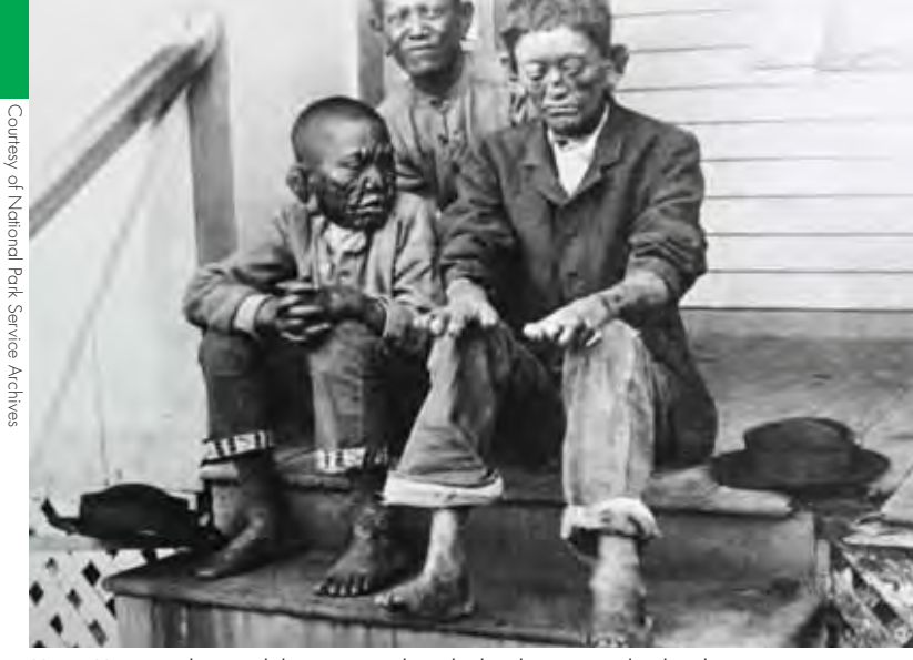
Young Hawaiian boys with leprosy were banished to the remote island settlement of Kalaupapa, away from their families and friends.

say this phrase, something I will never forget. 'This is your last place. This is where you are going to stay, and die.' That's what they told me. I was a thirteen-year-old kid."