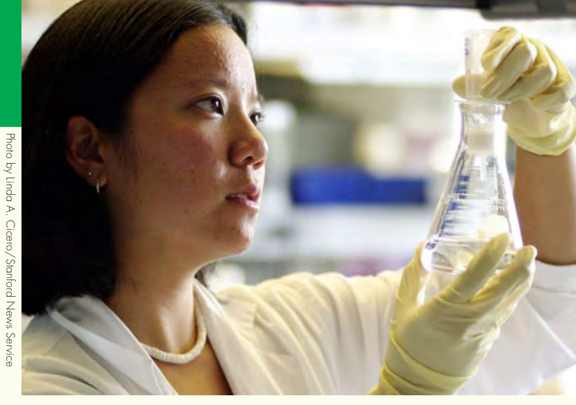
NIH funding boosts California's economy by supporting scientists' salaries and research projects, such as those conducted in this Stanford University Medical School dermatology lab.

As an example, Collins cited data that shows every $1 of NIH health research funding, including for global health, returns $2.21 in goods and services in just one year. In