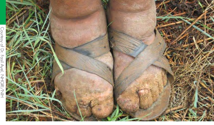
NIH scientists have discovered a genetic link to podoconiosis, a disease that causes swelling and disfigurement in some people, after extended exposure to volcanic soil

The authors said their study provides a research model for other fibrosing diseases, such as filariasis and pneumoconiosis, and for complex gene-environment inflammatory diseases, which are often poorly understood. They added that studies of podoconiosis patients in other parts of the world might reveal additional genes involved in disease susceptibility.