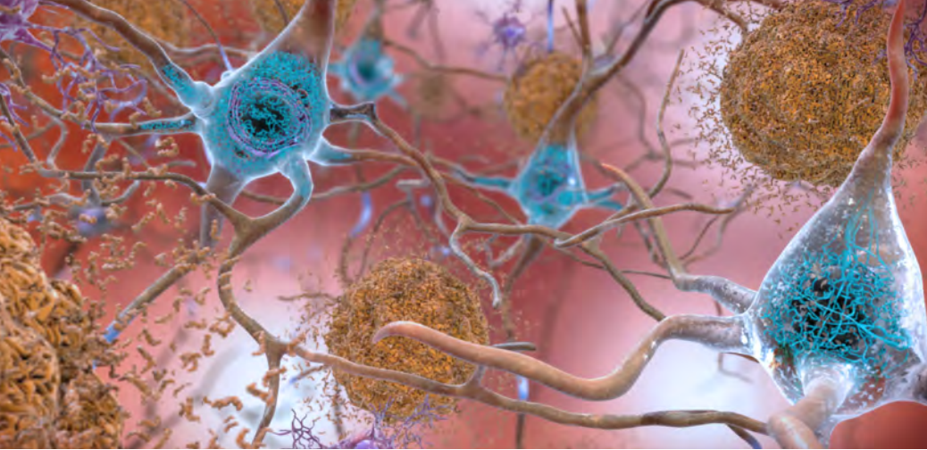
Beta-amyloid plaques and tau in the brain