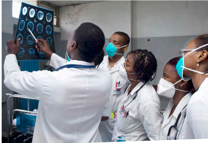
The new Health-Professional Education Partnership Initiative (HEPI) program will strengthen the research and health care workforce in eight African countries.