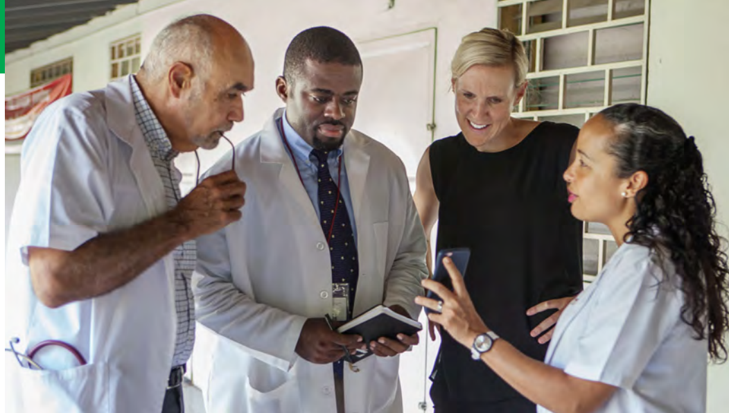
Years of mentorship at GHESKIO and Weill Cornell have helped train scores of Haitian researchers with Fogarty support.