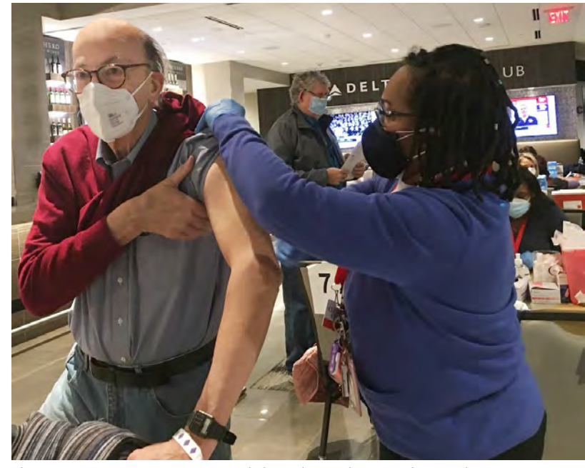
The vaccines against COVID-19 provide hope the pandemic can be tamed.

The coronavirus pandemic has laid bare the inequities in our health systems—both at home and abroad. There is much hard work ahead for all of us. It is imperative that we dig deeper into the fundamental causes of disparities to understand contributing factors and identify possible effective interventions. At Fogarty, we are examining how we can improve diversity among our staff and in the global health research workforce.