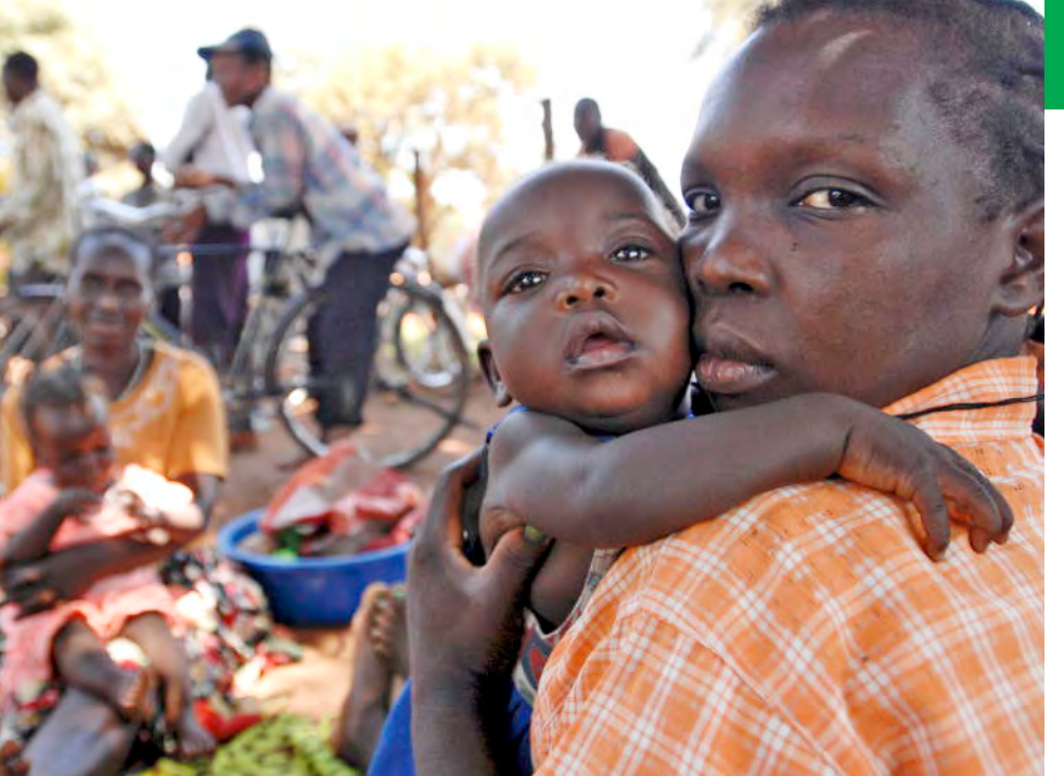
Conducting research in unstable settings is challenging but vital to ensure refugee health interventions are evidence-based.