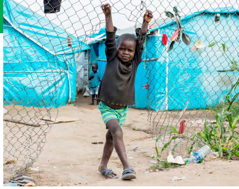
This collection of case studies illustrates the unique challenges involved in conducting research in humanitarian crises and strategies used to address them.

Since 2017, Rohingya people have been sheltering in the refugee camps of Cox's Bazar, Bangladesh due to armed conflict in the Rakhine state of Myanmar. With half the population made up of adolescent girls and women, sexual and reproductive health (SRH) services are vital. A research