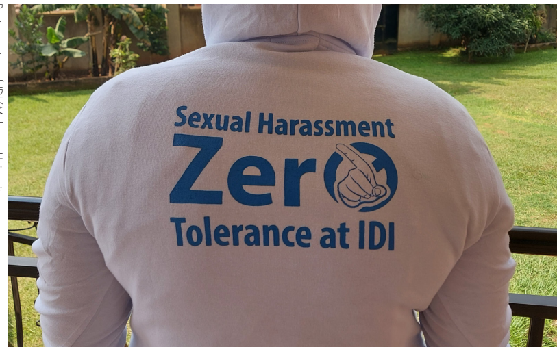
Fogarty provided supplemental funding for grantees to develop or strengthen sexual harassment policies and practices.