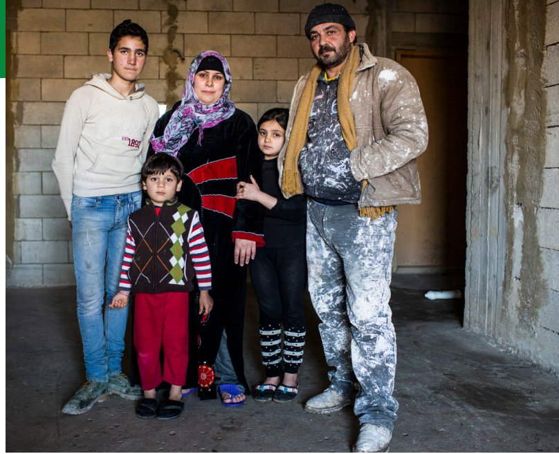
Fogarty grantees are developing family-focused interventions—that include men—designed to reduce post-traumatic stress disorder, anxiety and depression among Syrian refugees.