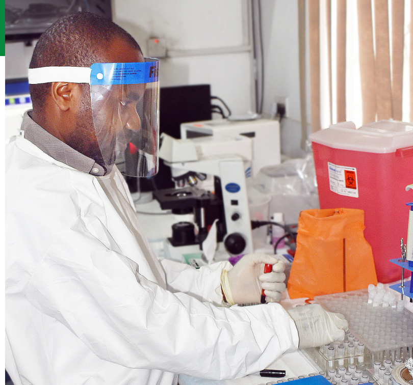
Numerous former Fogarty trainees have been using their expertise to study the effectiveness of COVID-19 vaccines and monoclonal antibody treatments at low- and middle-income country trial sites.