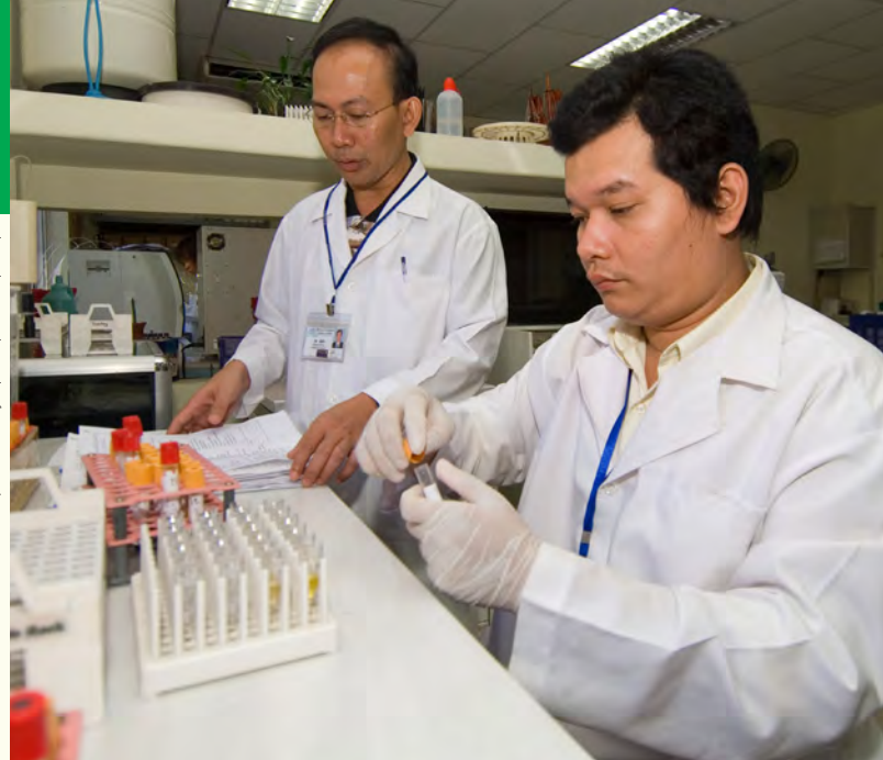
More than 2,000 physicians and scientists in 100 developing countries have received training through Fogarty’s novel AIDS International Training and Research Program (AITRP).

training program that would arm promising developing country scientists with skills in epidemiology, lab techniques, ethical research practices and data analysis—in addition to subject matter expertise in HIV/AIDS and related diseases. The trainees would remain engaged in research studies of importance to their own communities and receive support to continue their projects when they returned home, a feature designed to prevent brain drain and ensure their expertise was deployed where it was needed most.