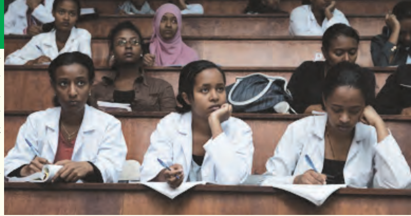
AITRP trainees exposed to the U.S. academic culture not only learned about science topics but also became familiar with a more questioning, interactive approach to education and research.