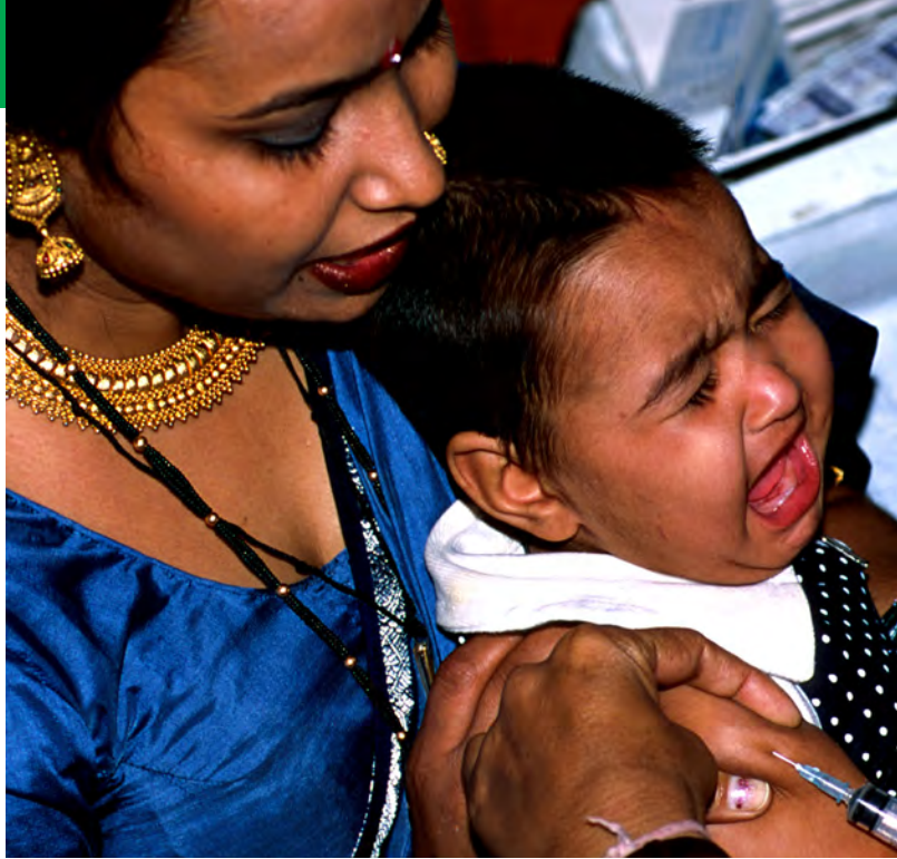
Many children in developing countries do not yet have access to life-saving vaccines. The GAVI Alliance, a private-public partnership, raises funds to supply vaccines and since 2000 has reached more than 326 million children.