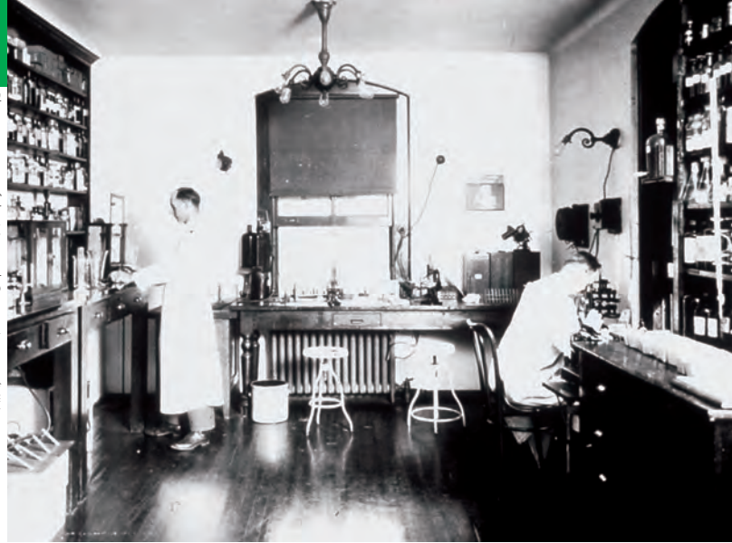
In 1887, Dr. Joseph Kinyoun set up his one-room Hygienic Laboratory on Staten Island, New York, to research cholera and other infectious diseases. This was the early beginnings of what is now the NIH.

produce the rabies vaccine, among other things. Kinyoun brought new reagents, techniques, protocols and ideas back to the Hygienic Laboratory, which by then had been moved to Washington, D.C. His international research partnerships included studies of the recently identified plague bacillus, the diphtheria antitoxin and other novel biological agents.