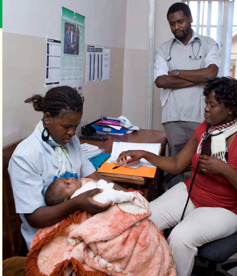
Studies in developing countries brought valuable findings on how to significantly reduce the transmission of HIV between an infectious mother and her baby, including through breastfeeding.