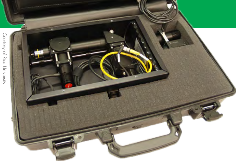
To mark its 10th anniversary, the NIH's National Institute of Biomedical Imaging and Bioengineering celebrated innovative projects it has supported, such as this portable, battery-powered fiber-optic microscope that provides accurate cervical cancer diagnoses in remote settings.

In recognition of the NIBIB's many accomplishments, the U.S. Senate unanimously passed a resolution marking the anniversary. "The NIH is an engine in America's innovation economy," said Senator Barbara Mikulski, who represents Maryland. "And it is a hope for those with loved ones suffering from a disease or condition that has no cure. I'm proud to support research and innovation at the NIBIB creating new treatments and cures to save lives and keep families healthy."