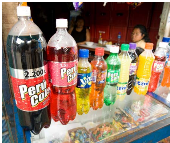
Some Latin American countries have levied taxes on sugary beverages as a means of lowering child obesity.

Still, context matters when implementing policies and programs. Successful interventions have necessarily followed different pathways of adoption in different countries. Implementation science makes an important contribution to the production of transferable lessons across Latin America and the U.S. and should be used for research and evaluation during policy and program development and application, the authors concluded. Future analysis is needed to understand the value of different implementation science systems frameworks that can inform policy decision-making, context fit, equitable impact and cost-effectiveness.