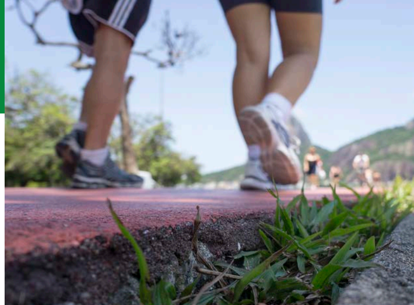
Researchers in the U.S. and Latin America are collaborating on strategies to reduce childhood obesity, a growing global health problem.

At both national and local levels, Latin America and the U.S. have been implementing innovative policy interventions to tackle obesity and noncommunicable diseases, including taxes on sugar-sweetened beverages and food warning labels. However, the authors noted, studies and programs are too often siloed, resulting in a fractured response to a highly interconnected region-wide issue. The publication highlights the many research