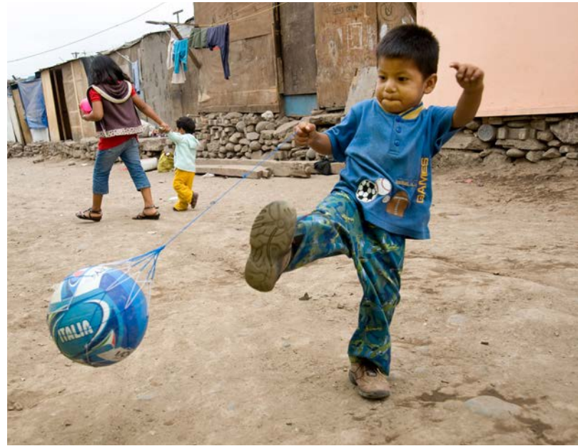
Better tools are needed to measure factors such as physical activity to aid efforts to reduce childhood obesity.

High levels of childhood obesity among Latin American populations can be conceptualized as the result of a complex system encompassing the food, school and transport systems, sociocultural and environmental influences, and numerous other interacting factors, another paper in the series stated. Yet it is known that complex systems tend to settle in stable states and resist