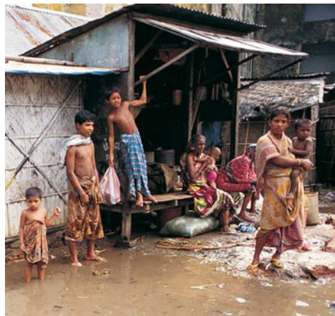
The NIH is requesting advice on how to best advance six research priorities related to climate change and health.

In a Request for Information (RFI) published in the NIH Guide, respondents are asked to provide advice on six research priorities related to climate change and health—innovative approaches, scientific infrastructure, partnerships to address environmental injustice, rapid response capacity, training needs to build a diverse climate change and health research work force, and dissemination and translation of research findings into strategies that protect health.