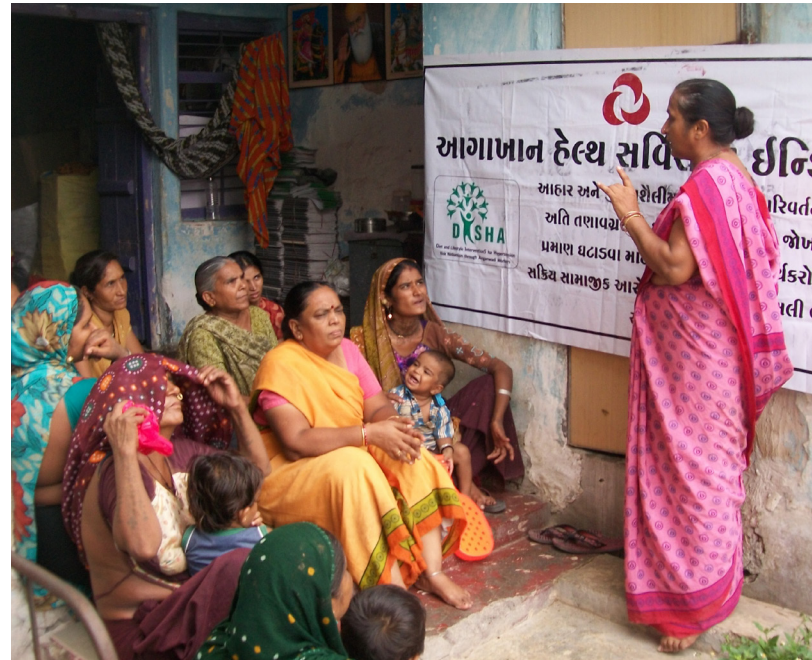
India’s Centre for Chronic Disease Control is a collaborator in the COALESCE program. Pictured: Participants learn about a study at the Centre.

“As training director, I saw the Ethiopian fellows improve their abilities to think through scientific questions and present to scientific audiences. On the Indian side, I saw