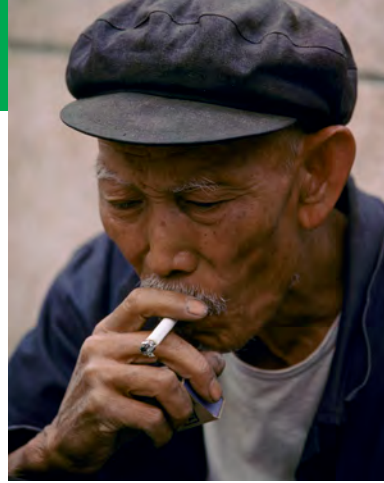
One of Fogarty’s new goals is to focus on research and training to address the rising tide of chronic, noncommunicable diseases in low-resource settings.

keep them up-to-date throughout their careers,” Glass explained. “Now that more people in LMICs have cellphones than toilets, we see growing opportunities to adapt mobile applications to improve access to populations for research and provision of care.” It will be critical that these projects are carefully monitored and evaluated to ensure they are effectively integrated into the practice of medicine, public health and research, he said.