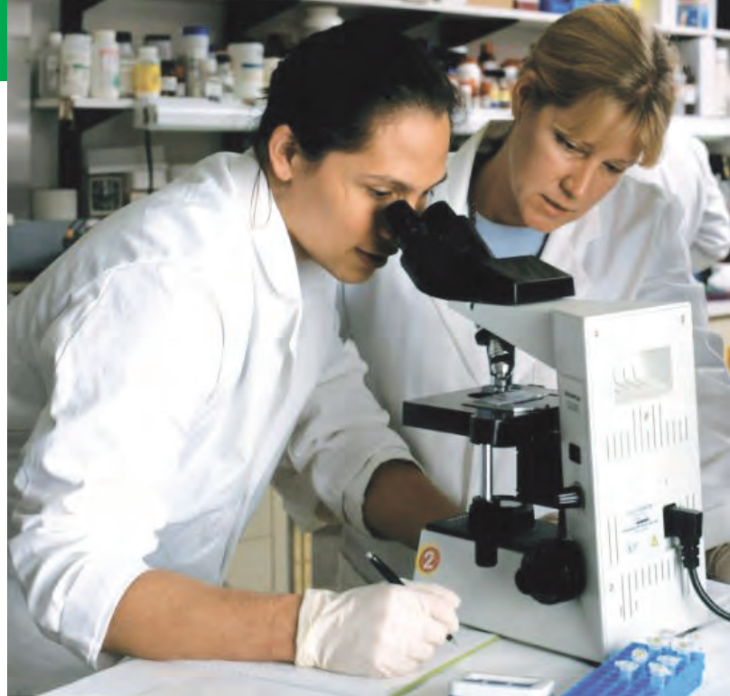
New laws, licensing terms and global partnerships are speeding translation of scientific discoveries into lifesaving biomedical products.