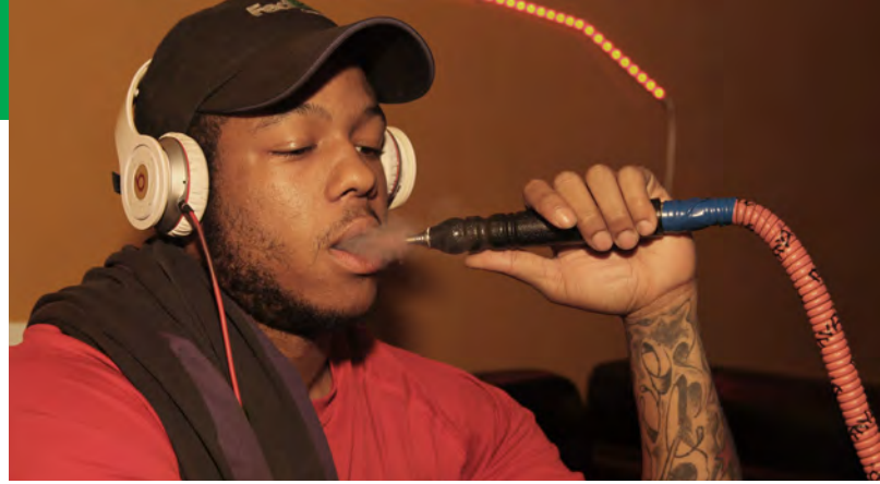
NIH-funded researchers have shown waterpipe smoking, popular among U.S. college students, carries serious health risks.

are contained in “tar” that is present in the smoke, and enough nicotine to cause dependence. In sum, both users and bystanders breathe in compounds that cause lung inflammation, oxidative stress, higher counts of immune cells and other precursors to cancers, chronic obstructive pulmonary disease and cardiac dysfunction.