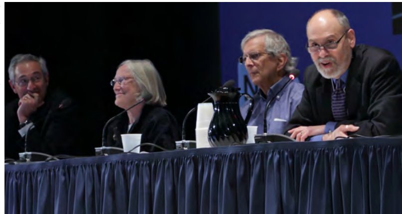
NIH leaders discussed a number of significant accomplishments of Fogarty's brain disorders program, which receives broad support across the Institutes and Centers.