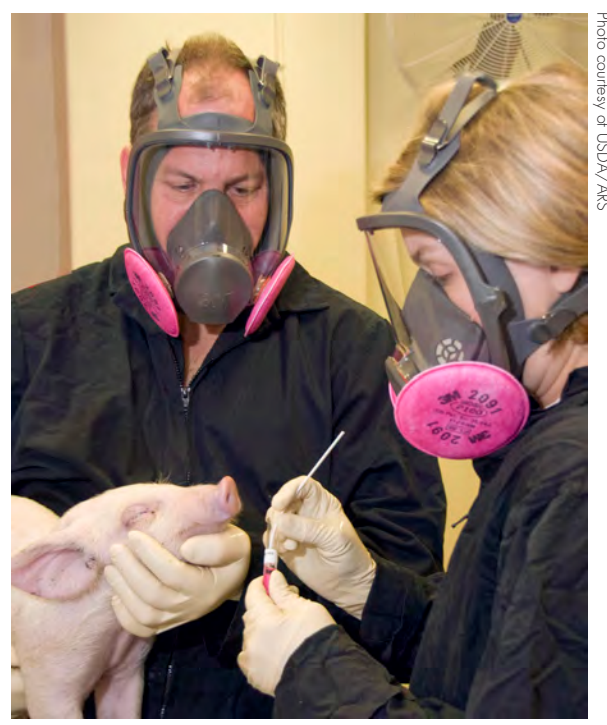
Global trade of live pigs increases the risk of an influenza pandemic, research shows.

Although pig surveillance has picked up around the world since the 2009 pandemic, the animals receive much less attention than birds, another particularly accommodating host for influenza genetic diversity and reassortment. Bird deaths spark media headlines, intense surveillance and prophylactic killings, but while sick pigs may lose weight, they typically stay alive. "You can have viruses lurking in pigs that might be more dangerous to humans, but we're not detecting them, they're not in the news," Nelson said. "In some ways, the pig viruses may be even more dangerous because they'd be silent threats."