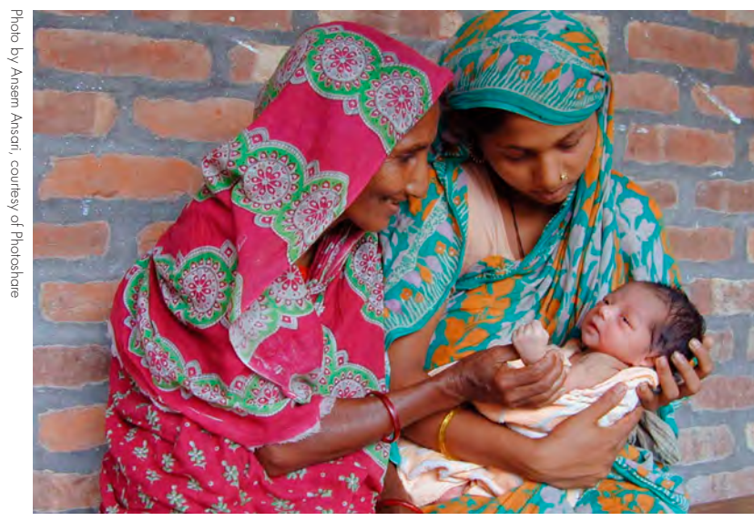
A grandmother helps attend to her granddaughter's infant in Bangladesh.

"With broad support from across NIH, we have been able to catalyze the field of brain disorder research on topics of relevance to developing countries, where these issues