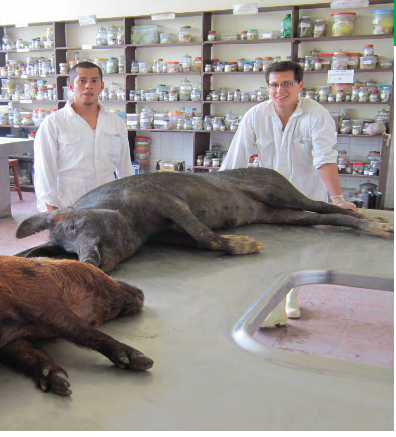
A vaccine has proven very effective at eliminating cysticercosis in Peruvian pigs but requires two doses.