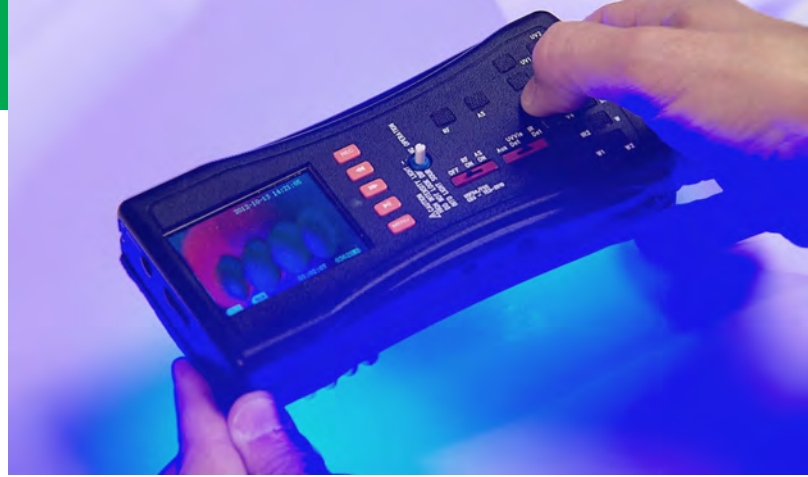
Scientists are developing and testing tools that differentiate between fake and authentic drugs.

attention to the need for global quality and safety oversight to prevent patient exposure to falsified products," writes Hamburg, who was recently named foreign secretary of the Institute of Medicine.