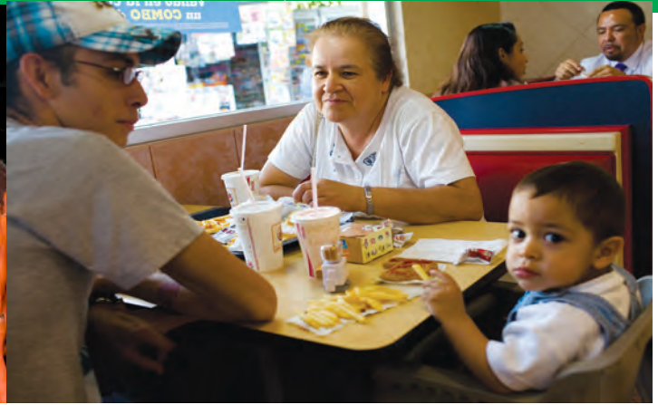
For over 20 years, NIH's Office of Behavioral and Social Sciences Research (OBSSR) has driven research on how to encourage healthy habits.

a cohort of Zambian children and documented a strong relationship between high adaptive behavior and reading-related progress.