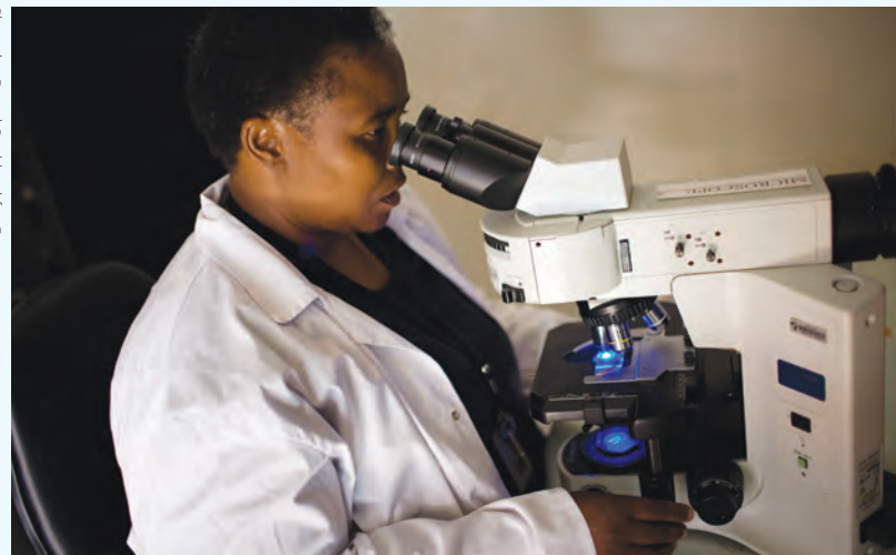
A U.S.-South African partnership will advance science on HIV/AIDS and other topics.

the National Institute of Child Health and Human Development, National Cancer Institute, National Institute of Mental Health and the Office of AIDS Research. A solicitation for a second round of applications is expected in about two years.