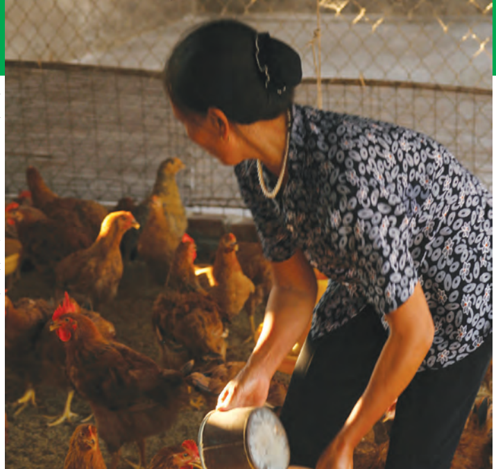
NIH offers a number of training opportunities for veterinarian-scientists, who have useful insights for studies of diseases that infect both animals and humans.

Institute (NCI) manages a combined residency/Ph.D. program to encourage veterinary graduates to do research in core diagnostics, pathology and other topics, with a view to completing their dissertation and receiving a degree from their home institution. NCI also coordinates one-year and summer pre-doctoral programs geared toward veterinary students.