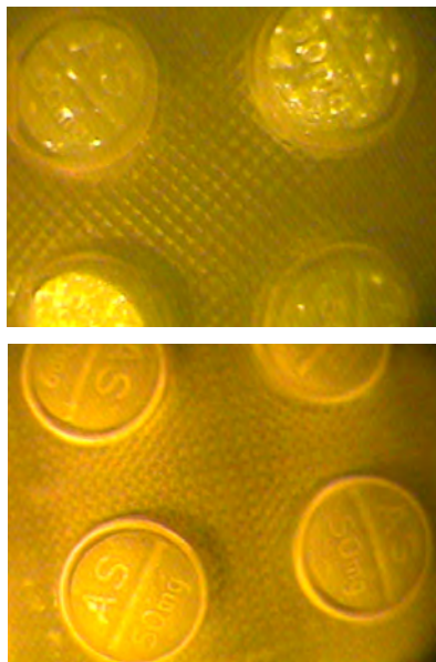
Poor quality and fake medicines (top photo) are an urgent threat that could undermine decades of efforts to combat infectious diseases in the developing world.

In an introductory essay, former FDA Commissioner Dr. Margaret Hamburg says globalization has added layers of complexity to the drug supply chain that require greater oversight. "Today's medical-product landscape blurs the line between domestic and foreign production, drawing