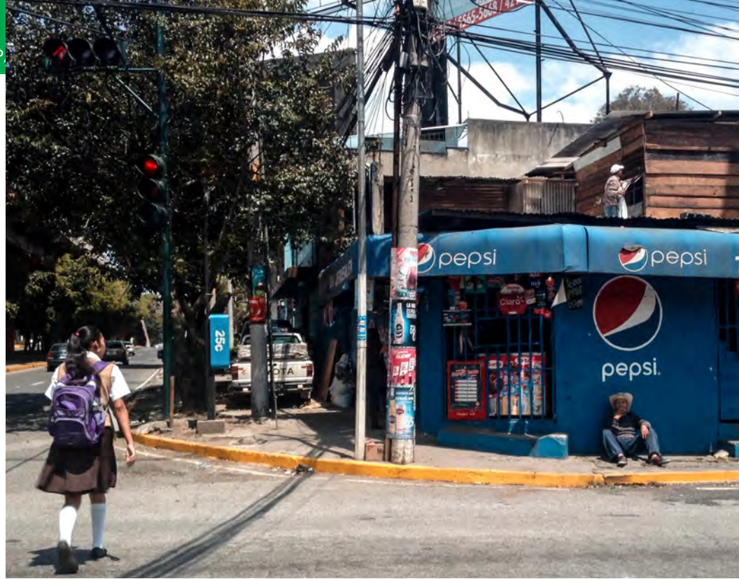
A Fogarty-supported project in Guatemala is studying the impact of food industry advertisements on obesity among children.

In another study, Chacon and colleagues examined fast-food restaurants' marketing strategies designed to increase consumption. They found that toy giveaways and price discounts were a factor and also discovered that nutritional information was not always available in the restaurants. They recommended public health advocates consider a comprehensive approach to encourage healthier choices, including policies requiring fruit or vegetable side dishes as options, accessible and easy-to-read nutritional information, and restrictions on toy giveaways.