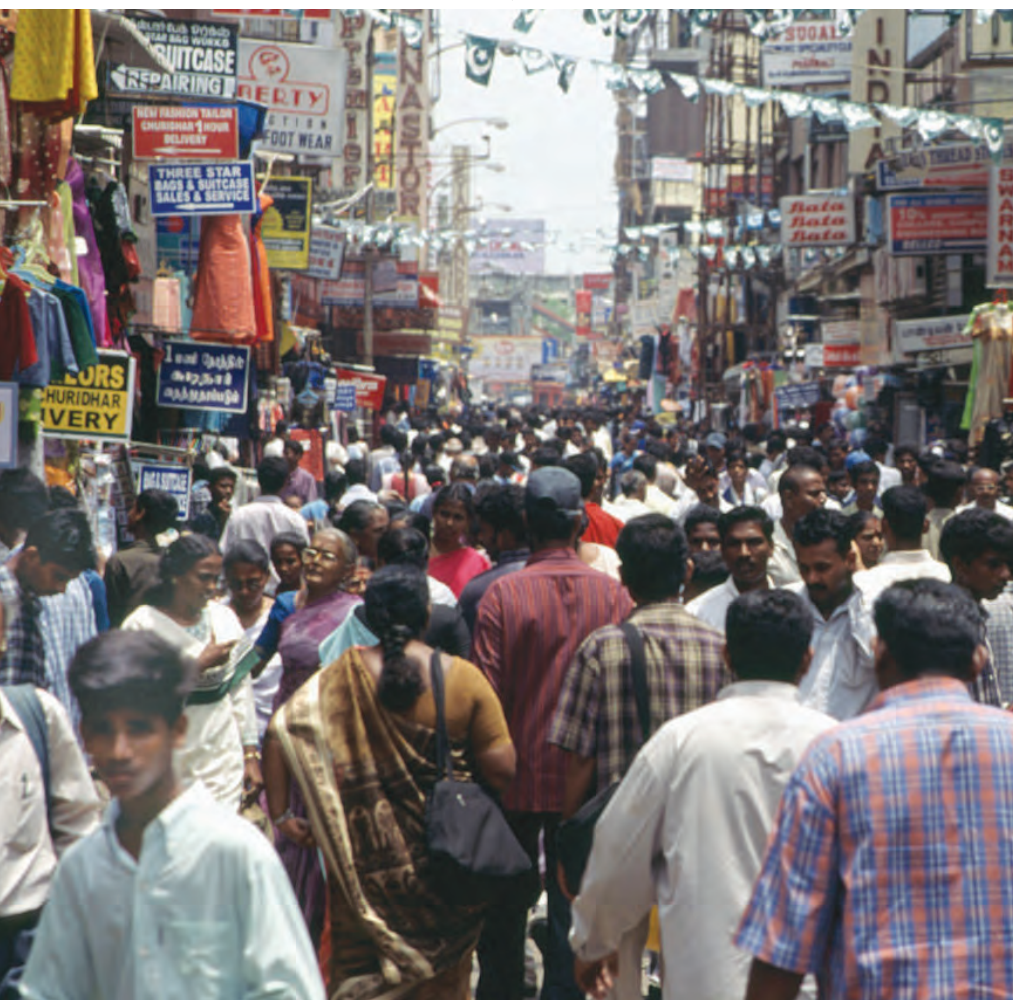
Pedestrian traffic on the busiest street in Chennai, India.

More than 50 NCD-Lifespan training grants, backed in full or in part by Fogarty, have been awarded since 2009 to institutions from Argentina to Vietnam, Egypt to South Africa. The aim of each program has been to train local researchers to better understand the growing threat from NCDs, determine the unique cultural circumstances and available resources, and map out the steps needed to reduce the dangers to health from chronic diseases.