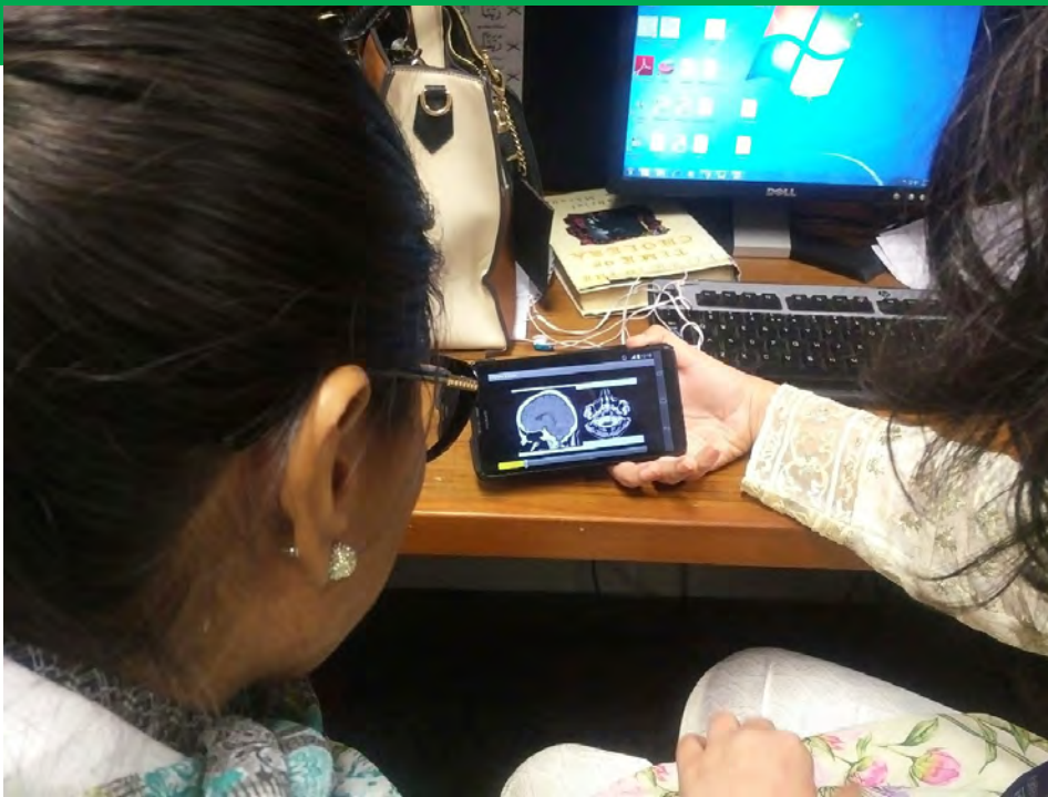
Fogarty funding has allowed Pakistani scientists to study targeted approaches to prevent and treat stroke using text messages and videos.