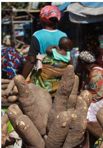
A woman carrying her baby walks in front of yam tubers in Nigerian market.