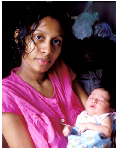
NIH-funded researchers are studying the link between nutrition and the microbiome in the hopes of discovering interventions that could improve health.