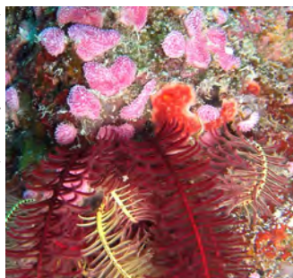
Studies of algae and seaweed may lead to drug discoveries.

will examine overlooked species—including coralline algae and slow-growing seaweeds—in dark, cryptic habitats, where organisms often employ chemical defenses to protect tissues that are difficult to replace.