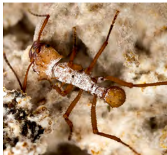
Fungal-farming ants may hold key to new antifungal agents.