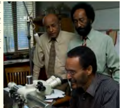
The NIH is planning the next phase of the Medical Education Partnership Initiative, designed to help faculty strengthen their research careers.

RESOURCE Website: http://bit.ly/NIH2MEPI