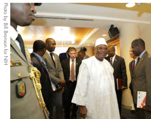
Malian President Ibrahim Boubacar Keita was one of several heads of state who visited NIH during the first-ever US-Africa Leaders Summit.