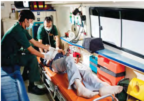
Fogarty support has enabled Pakistan to address injury—to build research capacity from scratch, leverage additional funds and focus policymaker attention on reducing this health burden.

term gains, which typically involves developing a core group of experts who can instill their knowledge to the next generation of trainees, and this is happening in Pakistan. Six graduates with master's degrees supported by Fogarty are now on the Aga Khan University faculty, where they are designing curricula, teaching trainees and conducting and mentoring research.