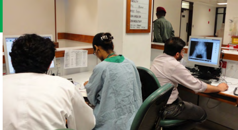
Pakistani scientists have studied ways to reduce the impact of trauma and injury in Pakistan.