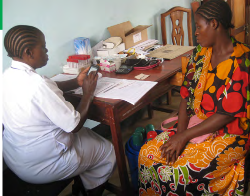
Africa's HIV care delivery platform should be leveraged to diagnose and treat the rising tide of chronic diseases, such as cervical cancer, scientists suggest.

research capacity and the breakdown of disciplinary silos. They also recommend existing HIV clinical databases be expanded to include measurements of risk factors for chronic illness, such as body mass index and protein in the urine. Screening for depression and cervical cancer could also be integrated into HIV care, the authors said, since both take a huge toll in sub-Saharan Africa.