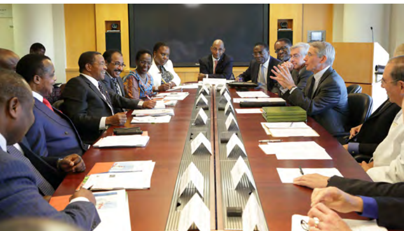
NIAID director Dr. Anthony Fauci (right) discussed vaccine development and other ongoing infectious disease research with African leaders.

“Investing in health is not only the right thing to do, to reduce suffering from disease. It also results in economic returns,” Collins told his visitors. The NIH currently supports research and training across the African continent through about 1,500 grants, representing a significant portion of its international activities. Since Africa is home to seven of the world’s 10 most rapidly growing economies, “this seems like a great opportunity to talk about the potential to go even further in making investments in biomedical research,” Collins said.