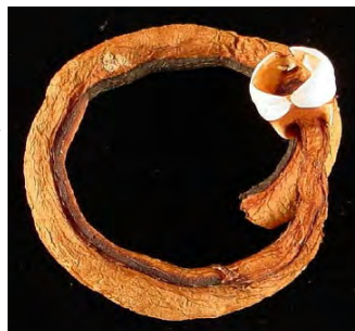
Mollusks, such as this shipworm, may be used to produce therapies for infections.