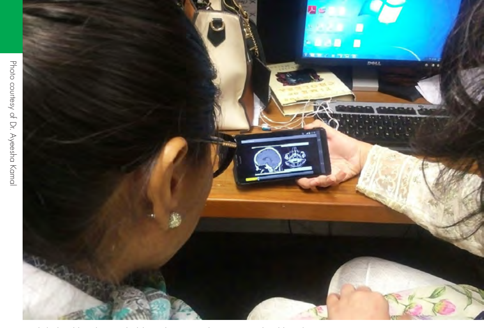
Mobile health solutions hold much potential to improve health in low-resource settings.

considered to be the largest markets and economies in Africacontinue to be dominated by the supply of orthopedics, prosthetics, patient aids and consumables from the U.S. The regulatory approval process for medical devices in Africa is lengthy, not transparent and skewed toward controlling entry into the market of substandard imports that pose a health risk, the authors reported. None of the ten countries discussed has specific regulations or regulatory bodies dedicated solely to medical devices, which can cause difficulties and delays in the process.