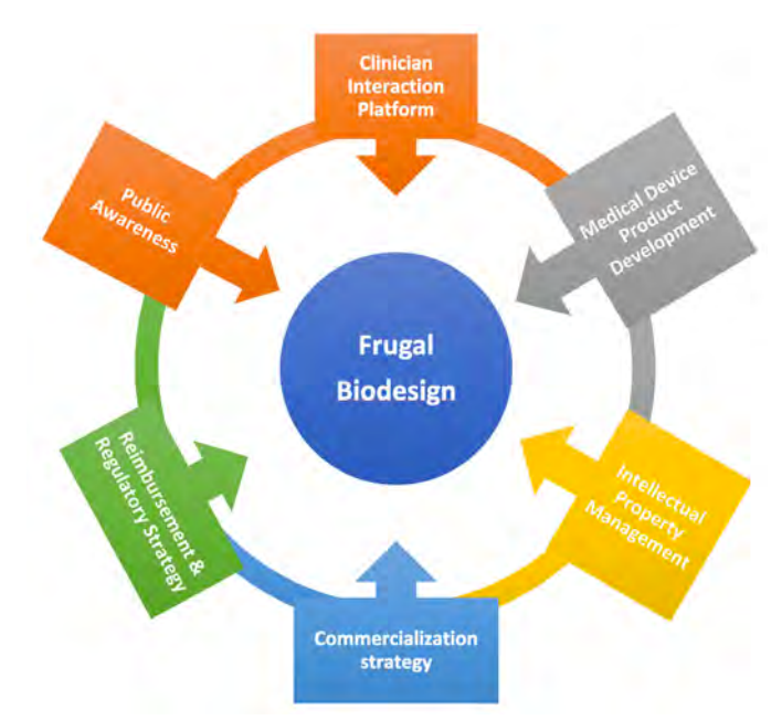
The stages of the Frugal Biodesign approach.

Frugal Biodesign—a unique approach to medical device design that is suited specifically to developing countries—is examined in one book chapter. The course, developed at UCT in South Africa, is aimed at stimulating postgraduate students studying BME to devise inexpensive and, more importantly, innovative solutions to medical problems. It recognizes the limitations that South Africa and other developing countries experience in terms of human, financial and physical resources. The medical devices that the students work on during this course are informed by clinicians. The course adopts a cyclical and dynamic approach that involves the constant exchange of information between multiple stakeholders.