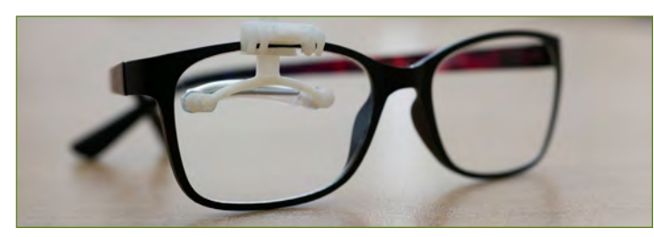
A 3D-printed device attaches to spectacles to elevate the upper eyelid in patients with myasthenia gravis, a condition for which treatment options are limited in low-resource settings.

Biomedical engineering is unique as an engineering specialty, in that it is a synthesis of engineering principles and medical practice, the authors noted. The unique professional identity of biomedical engineering requires ethical frameworks that are sensitive to both medical and engineering standards. While engineering ethics is narrowly focused on safety, and medical ethics on patient care, biomedical engineering ethics is at the intersection of safety and patient care, beginning at scientific experimentation and design, and extending through medical practice and administration. Understanding the history of engineering ethics and biomedical ethics is essential to understanding the evolution and future of modern biomedical engineering ethics, according to the authors.