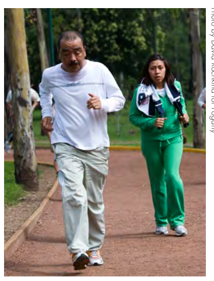
Diabetes, multi-morbidity care management and mental health issues are some of the topics being addressed through new Fogarty noncommunicable disease research and training grants.

Eight awards will fund exploratory research on a variety of NCD topics. For example, a checklist designed to improve trauma care will be implemented and assessed for effectiveness at a number of hospitals in Ghana by scientists at the Kwame Nkrumah University (KNU). A second KNU award will fund the first genetic studies of a craniofacial birth defect in a sub-Saharan African population. In Mali, researchers at the University of Sciences, Techniques and Technologies of Bamako will adapt an existing diabetes prevention program targeting individuals and couples and evaluate its impact. If successful, the educational materials produced in French could be scaled up throughout Francophone West Africa. Meanwhile, Makerere University scientists will develop and test a social network-