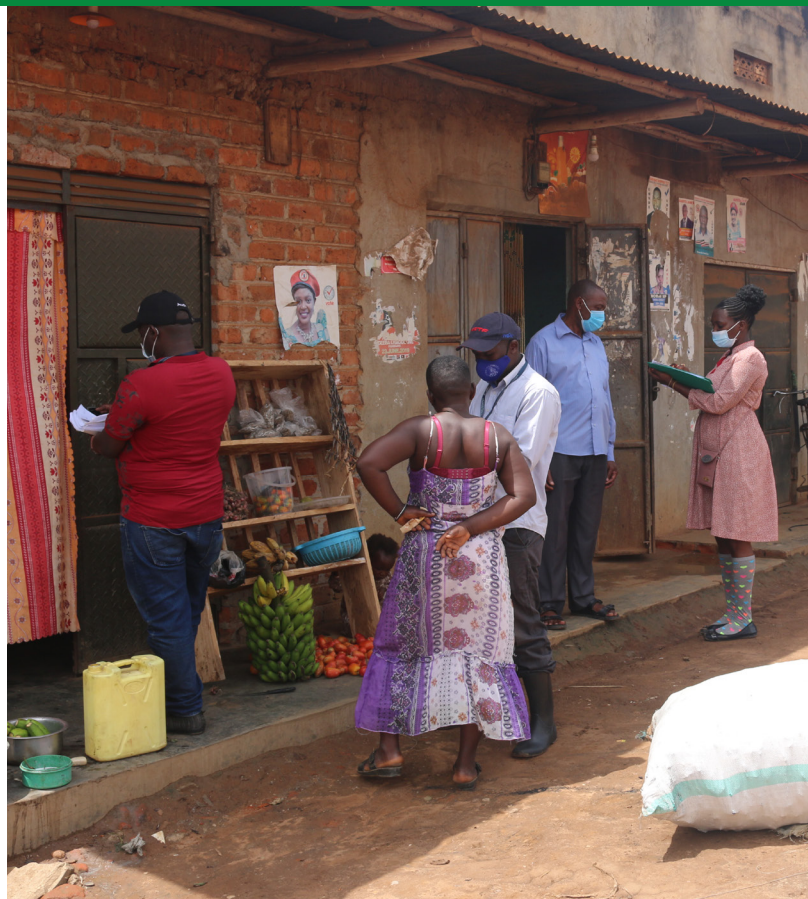
Fogarty grant supplements will support an array of COVID-19-related activities such as mentored research training in Rakai, Uganda.

COVID-19 disease, when combined with existing high rates of HIV/AIDS and tuberculosis, threatens fragile healthcare systems and infrastructures in sub-Saharan