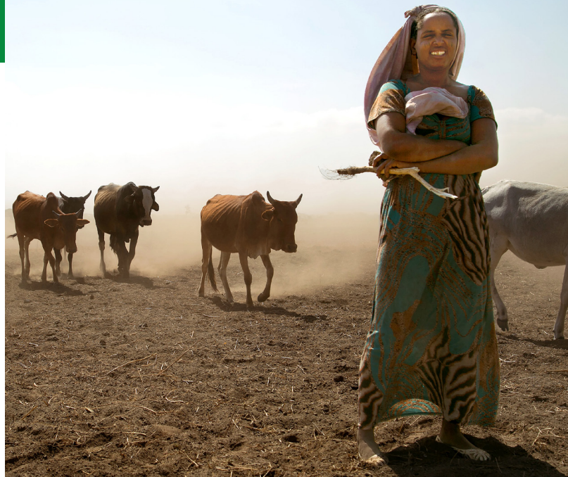
Four East African countries have produced climate change needs assessments for their countries through the Fogarty-managed GEOHealth program.

Water-borne and zoonotic diseases are increasing as well. Bacteria that live in water are more apt to multiply in warmer temperatures, while helminthic infections like hookworm (transmitted through soil) follow a similar pattern, said Simane. Zoonotic infections are already escalating. Currently, the nation has the fourth highest burden of zoonoses, which cause an estimated one-fifth of all human infectious diseases in low-income countries.