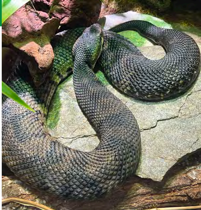
While most people bitten by poisonous snakes in the Amazon, like this cottonmouth viper, receive antivenom, it is often administered past the recommended six-hour window.

Next, the team piloted a training process for teaching community health workers how to administer antivenom, including identifying types of snakebite, dealing with