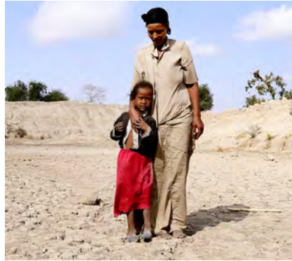
A woman and her daughter stand in a dried-out watering hole in Ethiopia.

The supplements are part of the NIH Climate Change and Health Initiative, an effort chaired by the National Institute of Environmental Health Sciences (NIEHS) that aims to reduce health threats from