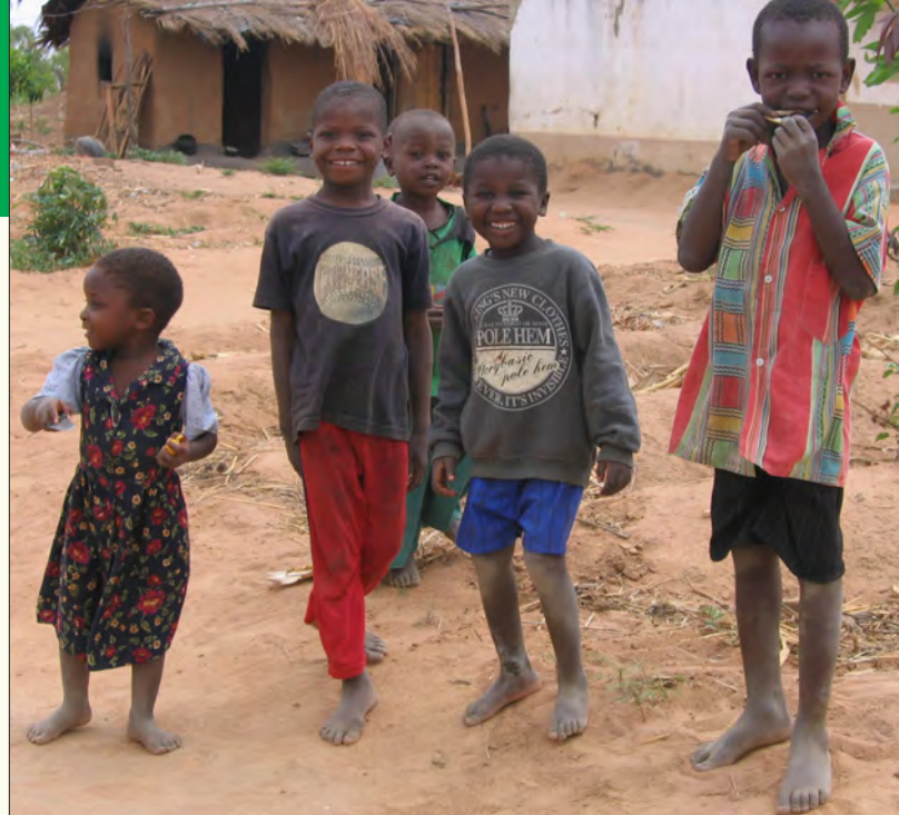
Africa suffers a quarter of the world’s disease burden but has only 3 percent of its physicians. MEPI-funded institutions are building capacity for medical education, both in cities and in rural areas where most of the population lives.

on humans. For the first time, the university is integrating distance learning as an option. It estimates 20,000 nurses can earn advanced degrees at their work stations rather than by traveling to Nairobi to attend classes.