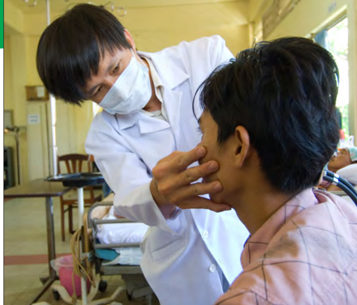
A fast, new diagnostic test, developed with NIH support, will help prevent TB deaths.

fellow at the National Institute of Allergy and Infectious Diseases, spoke recently at the NIH.