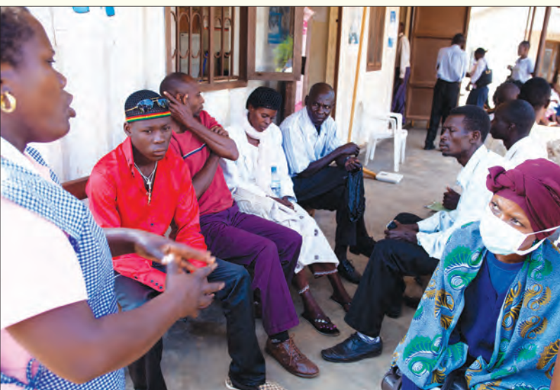
Africa’s remote areas have limited medical service. MEPI funds are contributing to new rural training programs to attract local students, who would be more likely to remain in the area once qualified.

In Nigeria, the University of Ibadan is making some funding available to postgraduate students, resident doctors and junior faculty as a way to spark interest in research careers. Funded projects include local health studies on the hepatitis E virus in pigs and humans, and HIV’s impact on infant hearing.