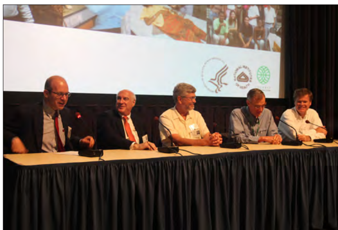
Fogarty grantees and collaborators met to celebrate the 25th anniversary of the Center’s AIDS research training program.

projects will focus on building or strengthening capacity in a particular scientific or critical research infrastructure area of importance to a developing country.