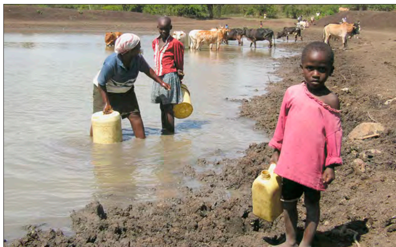
Fogarty's new program is intended to curb environmental and occupational illnesses in developing countries.